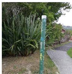
Stokes Valley Road

greater WELLINGTON REGIONAL COUNCIL Te Pare Matua Teāroa