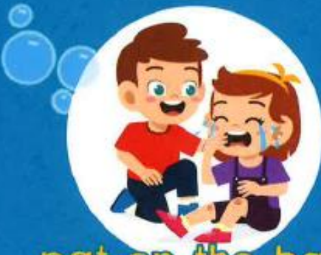
pat on the back