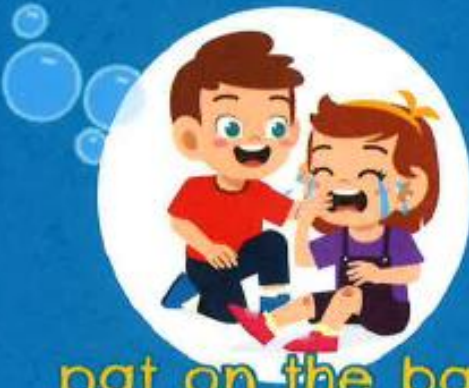
pat on the back