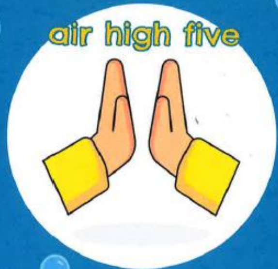
air high five